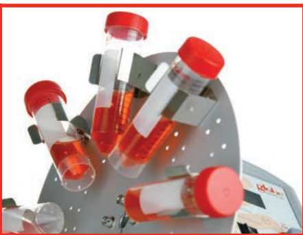
Included tube holder disk accommodates (8) 50mL tubes – additional tube holder disks are available