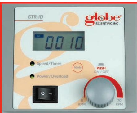
Digital display of the GTR-ID can be accurately set using the parameter adjustment knob